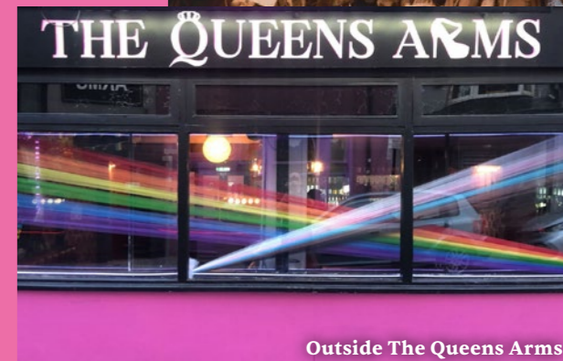
Outside The Queens Arms