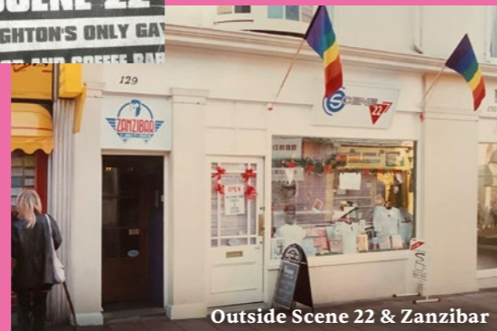
Outside Scene 22 & Zanzibar