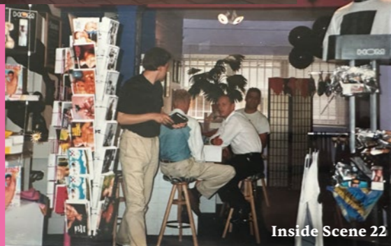
Inside Scene 22