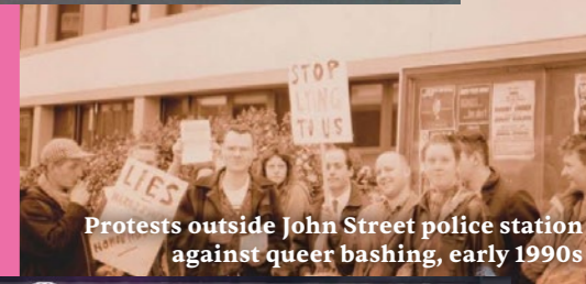
Protests outside John Street police station against queer bashing, early 1990s