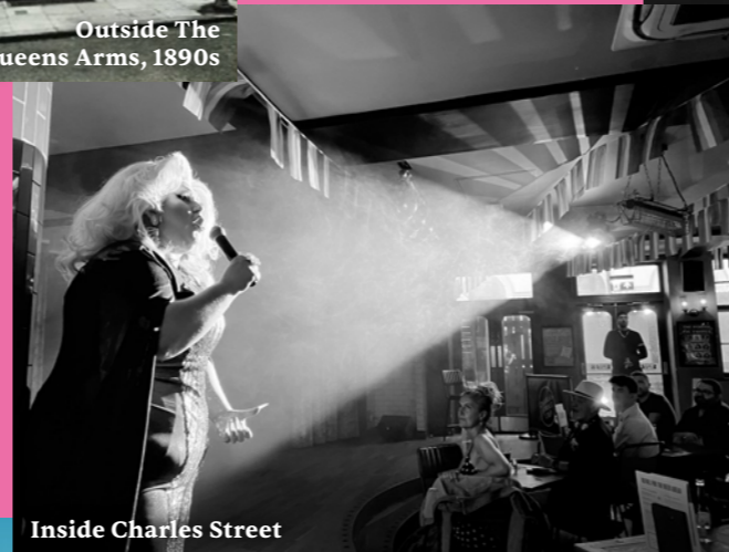
Inside Charles Street