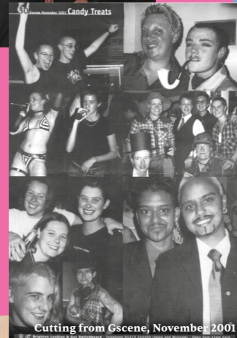
Cutting from Gscene, November 2001