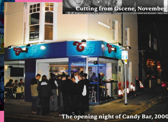
The opening night of Candy Bar, 2000