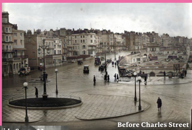
Before Charles Street