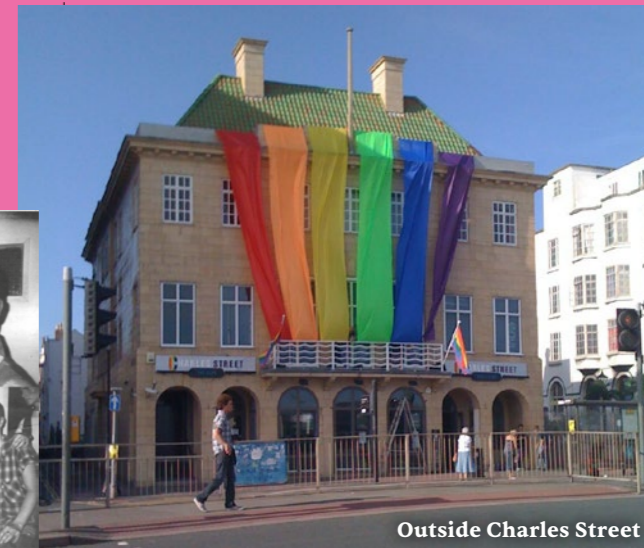
Outside Charles Street