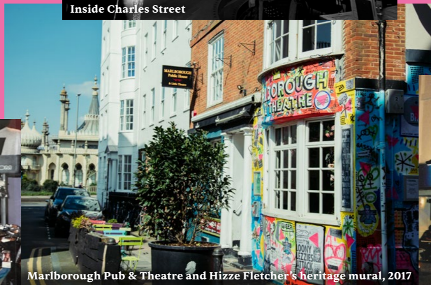
Marlborough Pub & Theatre and Hizzze Fletcher's heritage mural, 2017