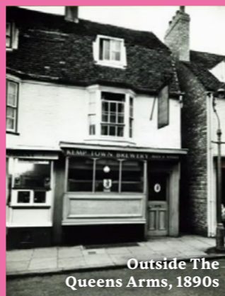
Outside The Queens Arms, 1890s